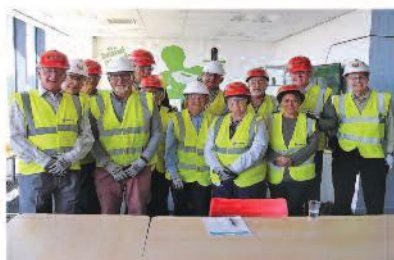
Visit to Leeds Recycling plant