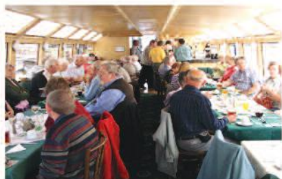
Cruising on the river Trent

www.probus.garforth@talktalk.net or contact Malcolm Taylor on 07741 203 307