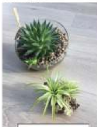
Aloes and Air Plants

We have several Phalaenopsis or moth orchids. It's easy to just go and buy a new one that's in full flower but it's a great feeling when you keep them and get them to flower again. Keep the foliage dry but roots damp. Bark chips in the pot allows good drainage as using potting compost would likely lead to rotting. The roots are attracted to light and so are best kept in see through pots.