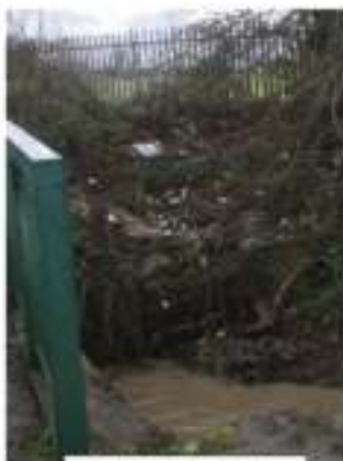
Rubbish alongside Sheffield Beck

A job to do when it's raining is to get my box of seeds out and dispose of any packets that are too old. If in doubt whether old seeds will germinate, I can take a small pinch and sow them when the packet tells me to, if they come up, the rest of them can be used and if they don't, they can be replaced. I'll do a list of what seeds I need because it focuses my mind to only get what I need, when going to buy them. Washing the greenhouse outside and in and used plant pots will be done before the greenhouse gets filled with seedlings from seeds sown in spring. Also, there will be the ongoing jobs of pruning, weeding and grass cutting to take care of.