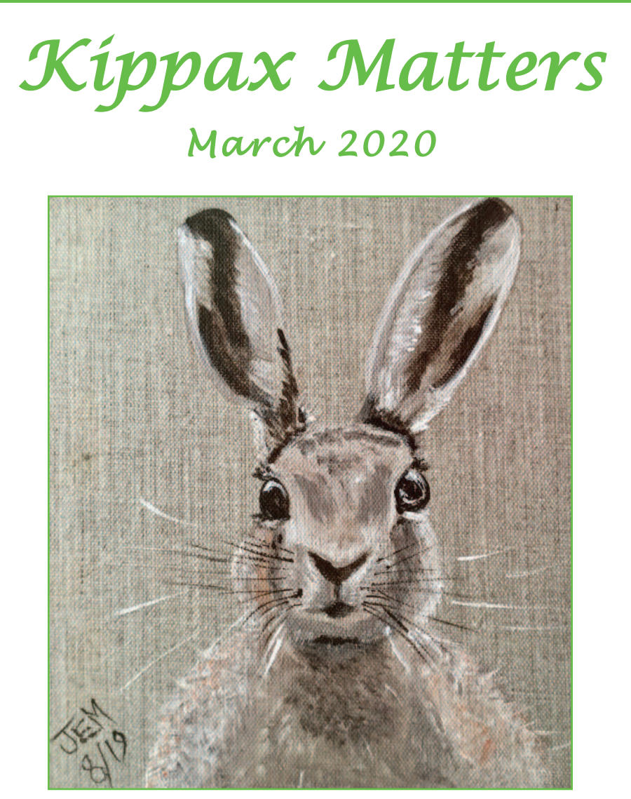
March Hare courtesy of Kippax Art Group