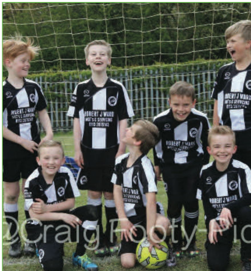
Kippax Athletic Under 10s (see page 16)