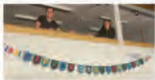
1981-2021 bunting made from old KGPS uniform's

We began the Autumn term with a whole-school topic based on the school's 40 th birthday. All children have studied the history and geography of our locality and looked at the significant changes over the past 40 years. Each class has visited an area of local interest as a focus for their Art work. The visit to Kippax church was especially memorable because our oldest children teamed up with the youngest to accompany and support them. It is wonderful to see year groups working together after the restrictions of the previous year. One of our wonderful volunteers made us bespoke Kippax Greenfield bunting from old uniform (see below), and the topic culminated in 80's themed class parties and a traditional fish and chip lunch.