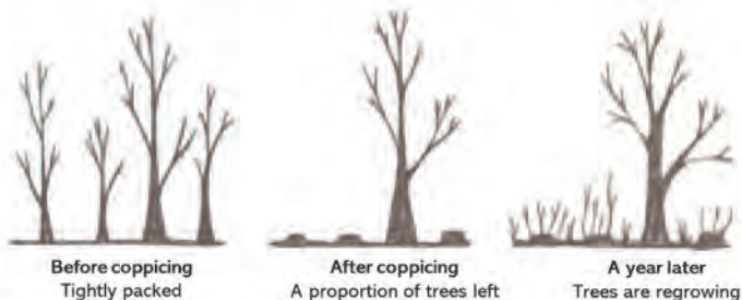
Figure 0 Diagram showing the process of coppicing

With this woodland being such a vital habitat for wildlife, its management is very important, and the practice of coppicing is used to manage the woodland at Townclose Hills. Coppicing is a technique that involves cutting certain trees within an area to their base, allowing them to reshoot multiple stems the following spring, regenerating themselves, before they are cut again after a number of years. This management mimics natural processes e.g. strong winds and storms that open up expanses of woodland allowing sunlight to get in.