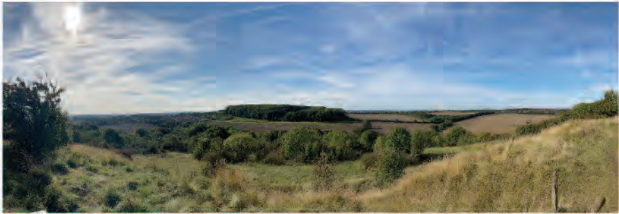
Figure0 The view from the top of Townclose Hills

Standing proudly in the middle of Kippax is the nature reserve Townclose Hills, a gorgeous site with rich meadows and a dominant hillside woodland (Billy Wood), which is managed by the Yorkshire Wildlife Trust and a team of dedicated volunteers. It has been a Site of Special Scientific Interest (SSSI) since 1984, with the grassland plateau showcasing stunning wildflowers during the summer, and the woodland being home to many unique species such as the glow-worm, and the lesser spotted woodpecker.