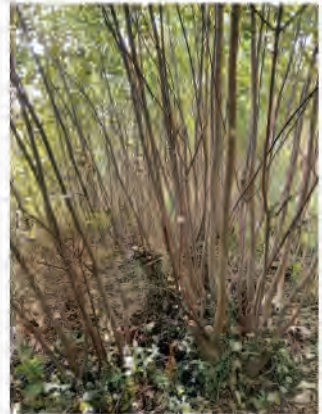
Figure 0 A coppice stool in Townclose Hills showing fresh regrowth after being coppiced

Coppicing at Townclose Hills therefore keeps the woodland healthy, maintaining its productivity, whilst also reaping benefits for biodiversity.